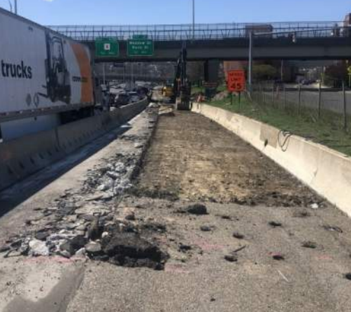
Temporary Bridge Removal